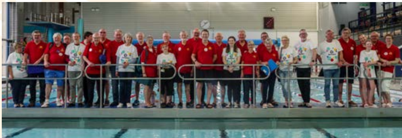
The Riverside, Demelza and volunteer team

Sunday 17th March saw the running of the 4th charity Swim Relay event by Rotary Club of Maidstone Riverside beat expectations to raise over £25,000 for local charities.