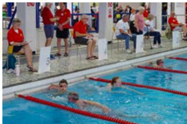
Lane recorders counting lengths

With planning starting in May and a website developed and eventually being signed off in the early autumn the team were in a position to start marketing with everything being channelled through the website. Using existing relationships with local charities, schools, sport clubs, businesses and other organisations the event started to take shape as Christmas approached although very little