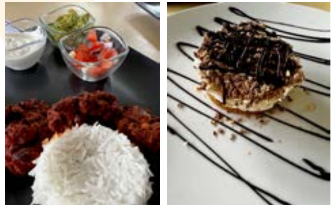
Some of the delicious dishes prepared by the Young Chef competitors