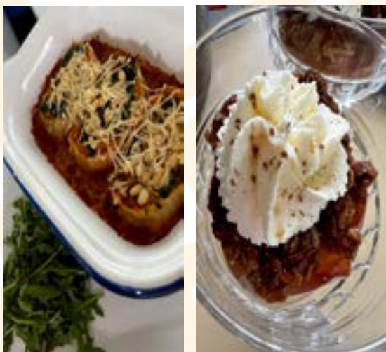
Darcy's winning dishes of butternut squash, spinach, and feta rotolo and baked apple with cream.