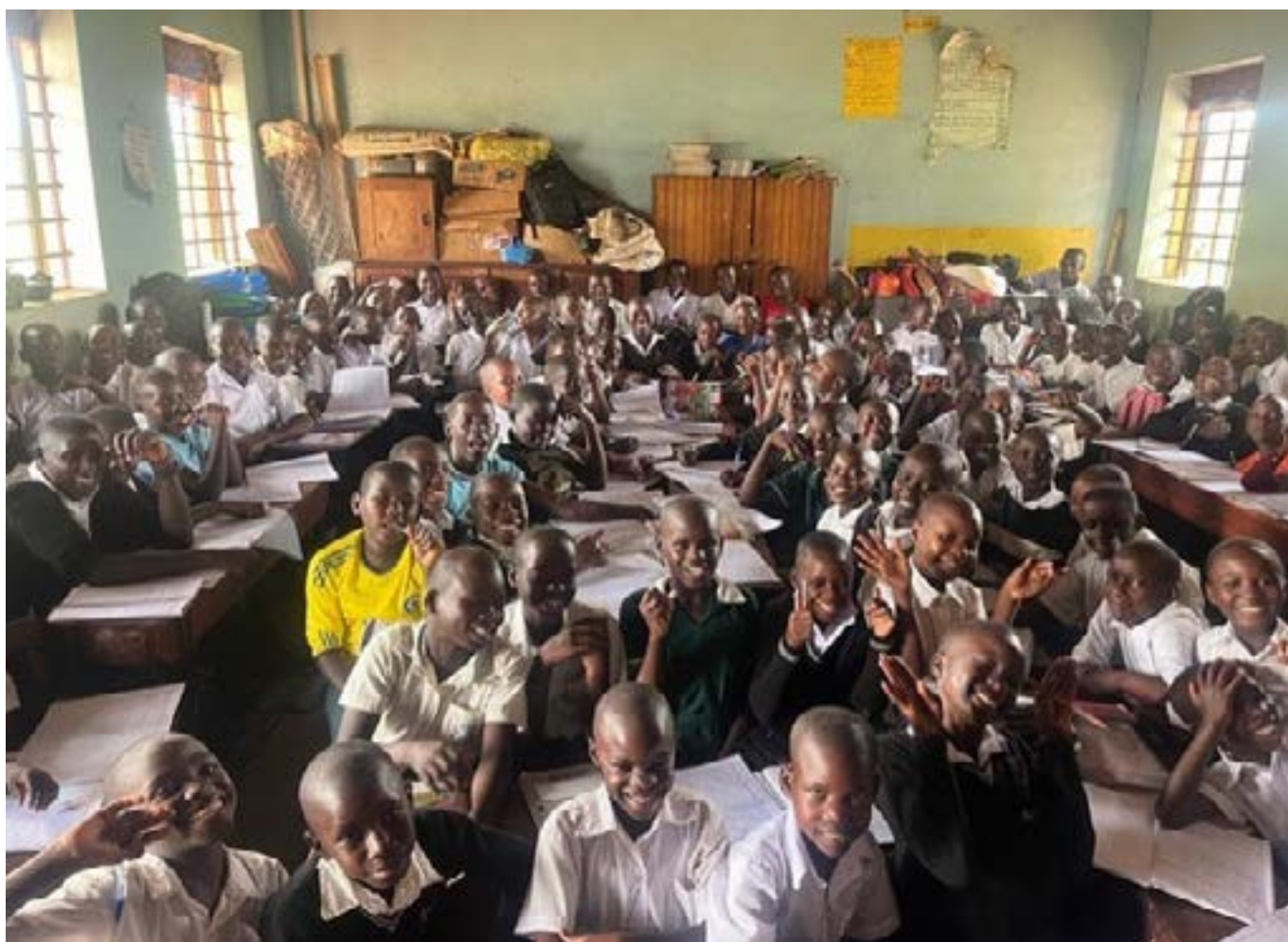
A typically crowded classroom at Kabalega.