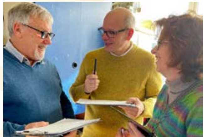
The three judges deliberate the entries.