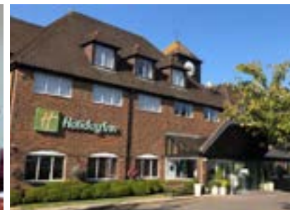
Holiday inn North, Maidstone Road