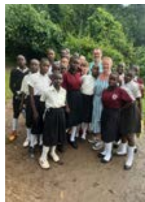
School outing – at the top of Murchison Falls.