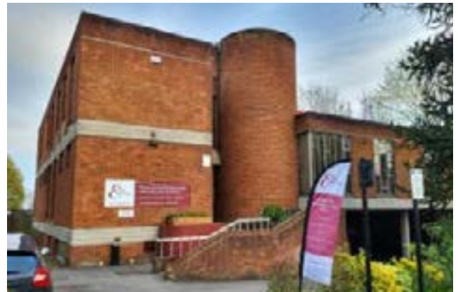
The Elwick Club

"The new venue will help us to accommodate bigger meetings as we are growing in numbers particularly since we initiated Associate Membership, which give prospective members a chance to sample is like what being a member without having to join as a full member." For more information search for 'The Rotary Club of Ashford'